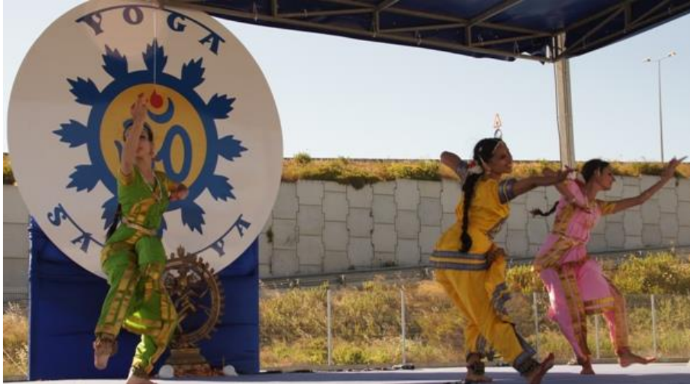
Bhárata Nathá Yama Presentation by the Shiva Rája Group

The Celebrations also emphasized the work devoted to Solidary Smile – Association of Support to Social, Environmental, and Cultural Causes, AGROBIO - Portuguese Association of Organic Farming, and LPN – Nature Protection League.