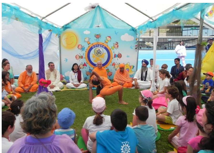
Yoga for Children – for the Defense of the Future – of self-responsibility and the preservation of the ecosystems and Fraternity