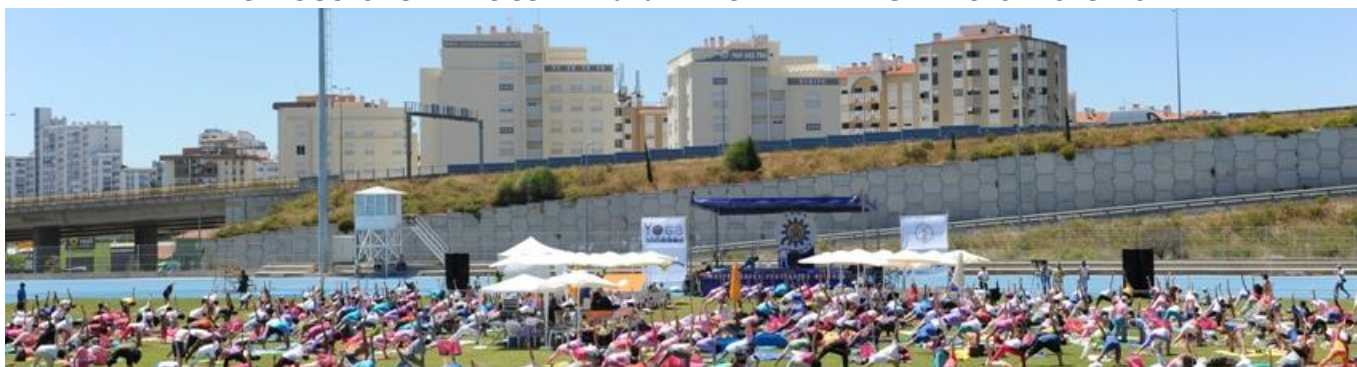
More than 1000 practitioners in the International Day of Yoga - IDY – Mega Yoga Class - Mahá Shakti Namaskára

Organization of the YOGA PORTUGUESE CONFEDERATION With the support of the LISBON CITY HALL, INATEL FOUNDATION, PORTUGUESE OLIMPIC COMITE and NATIONAL PLAN FOR ETICHS IN SPORTS