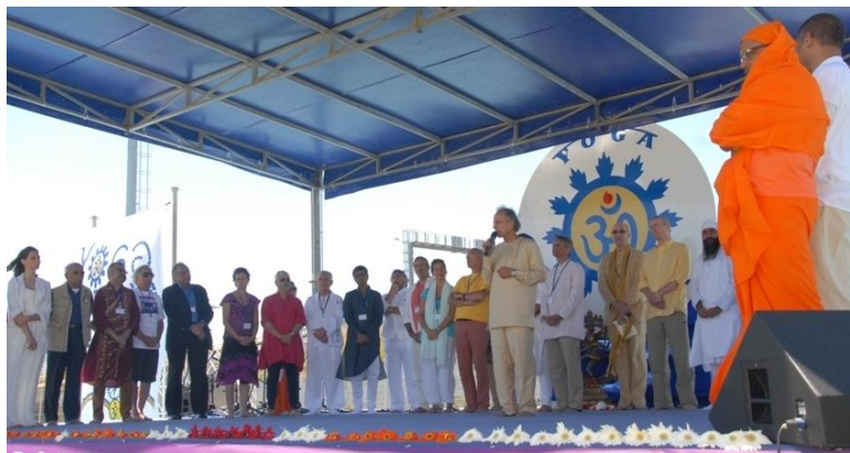
All the Yoga Schools on stage – India, Americas, Europe with Portugal included