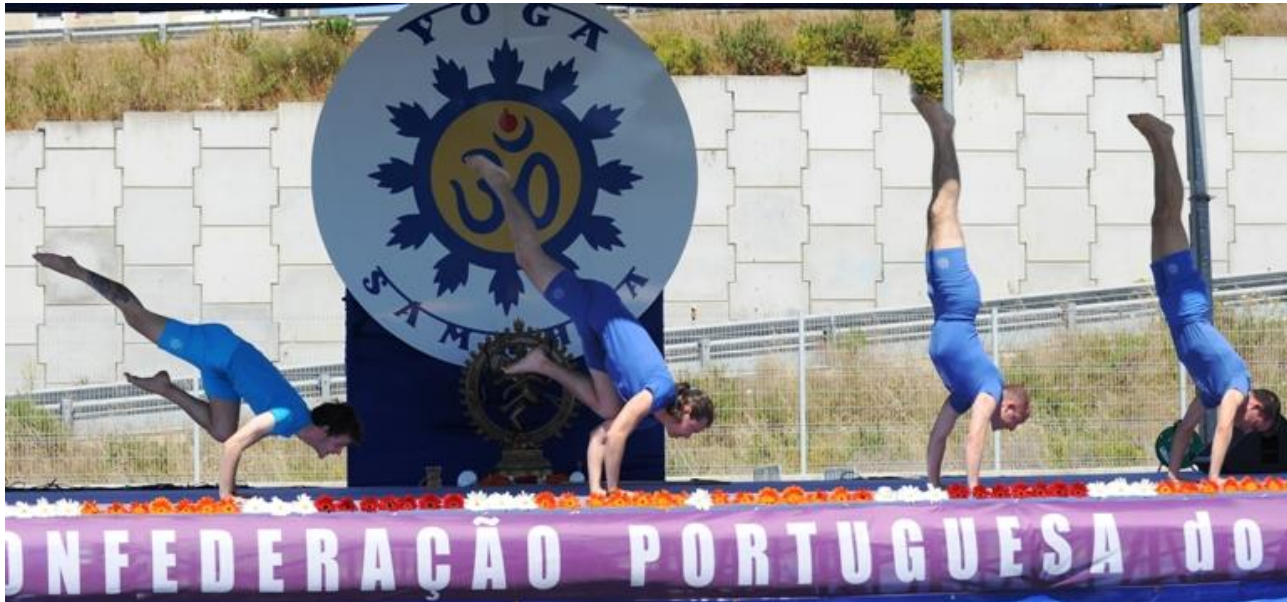
Advanced Yoga of PASHUPATI