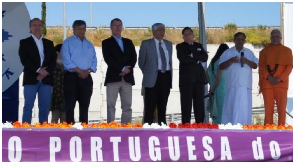
The Official Entities