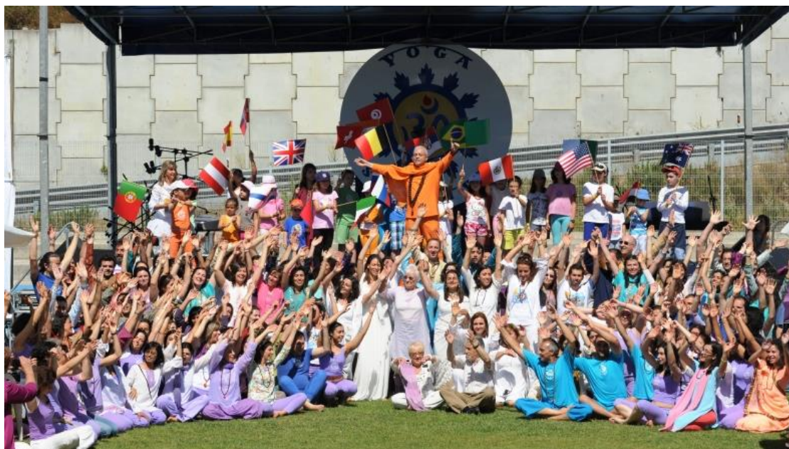
The Opening of the International Day of Yoga - IDY

The International Day of Yoga - IDY is a precursor Candidate to the United Nations / UNESCO to be the FIRST GLOBAL DAY , it is celebrated in a Cosmic Auspice – Supra Cultural – a Solstice – June, 21 st – (always celebrated at the following Sunday when not coincident).