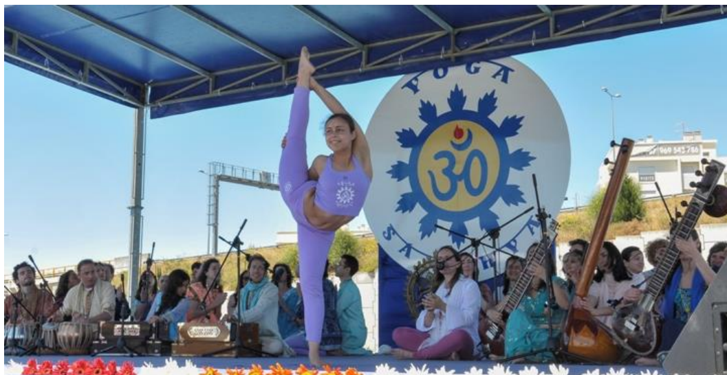
PASHUPATI and OMKÁRA on stage

This Day was already officially proclaimed in India in 2011 – December 4th and 5th – in a Summit that joined the Main Traditional Yoga Lineages of India, with the Co-Organization for the Yoga Portuguese Confederation (the only Institution outside of India that was accepted in this Summit). Since then, the number of Countries and Yoga Institutions that were joined to this movement has grown exponentially, and this year of 2013, the International Day of Yoga - IDY was celebrated in more than 30 Cities throughout the World.