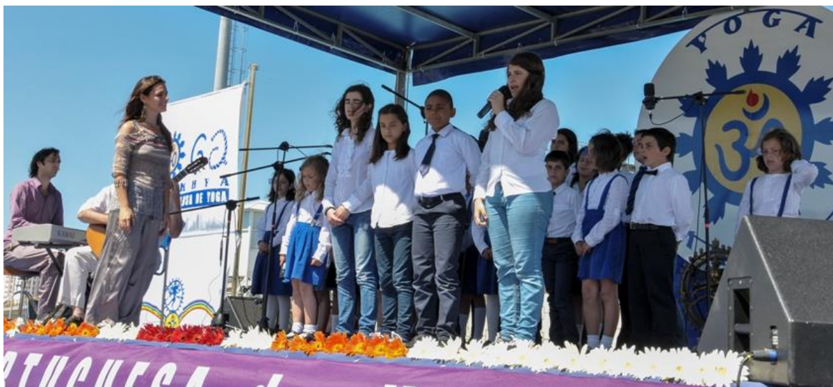
Santo Amaro de Oeiras Children's Choir

The opening ceremony of the International Day of Yoga - IDY for Children was made on stage by the Children's Choir of Santo Amaro de Oeiras, under the motto MY BLUE PLANET, which on May 2012 won the International Competition of the Global Rockstar, among 350 musics from all the World which lead them to participate on the Summit of Earth, in Rio de Janeiro. After the performance of the Children's Choir a Yoga Class specially dedicated to a hundred and a half children present was held.