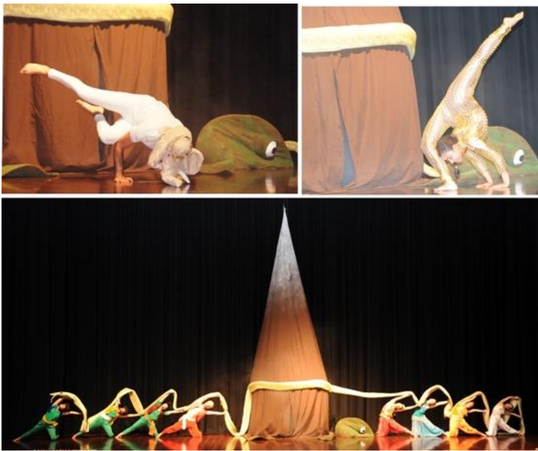
The Magic of the PASHUPATI Presentation