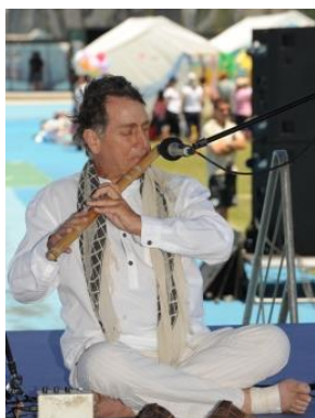
The fabulous Art of Rao Kyao and his music

THE CITY HALL OF LISBOA was the host of this Grand Celebration, having been a structural partner of this Global Project, contributing along with the EMBASSY FROM INDIA, the NATIONAL PLAN FOR ETHICS IN SPORTS, the INATEL FOUNDATION and the OLIMPIC COMITÉ OF PORTUGAL, for its valorization and divulging. Also the High Commissary or Immigration and Intercultural Dialogue, UNICEF, Pró-Dignitate Foundation, Youth Foundation, Portuguese Institute of Youth, e and all the Hindu Community from Portugal support this initiative.