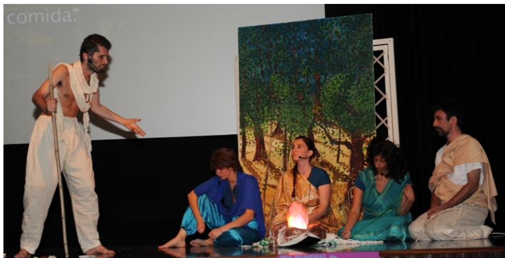
MĀYĀ – Amateur Theater Group of the Yoga Portuguese Confederation

This Day also counted with a presentation from the MĀYĀ – Amateur Theater Group of the Yoga Portuguese Confederation which brought to stage the “Aphorisms of Tradition – the Sandals of the Master and other stories” with Traditional Hindu Stories and from the Popular Wisdom.