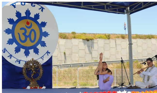
The symbiosis of the Flute of Rao Kyao and the Advanced Yoga of the Pashupati, in Yoga and Art