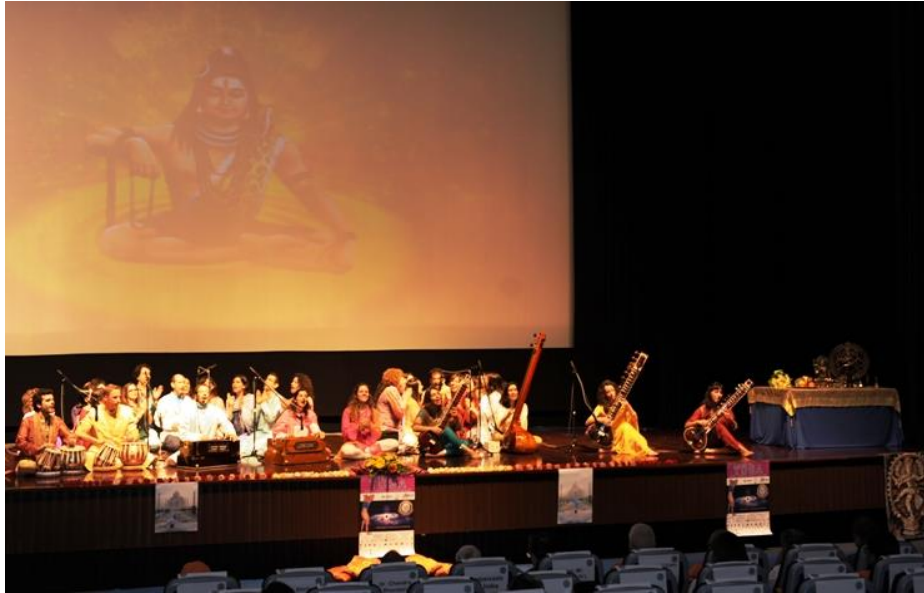
The Omkára at the Opening of the Darshana Day