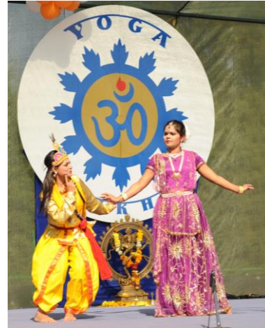
Advanced Ásana Demonstration and Traditional Indian Dance by the Global Yoga Alliance

Through the day there were several celebration activities, among them, a Mega Yoga Class for Everyone – Purusha Namaskára, Kirtana presentations by the Choir Orchestra – OMKÁRA, Yoga Demonstrations by the PASHUPATI – Advanced Traditional Yoga Demonstration Group for Adults and Children, Hindu Dance by the Group Shiva Rája – Group of Classical Dance from India - Bharatnáthyam, all from the Yoga Portuguese Confederation. There were also Advanced Ásana Demonstrations and Hindu Dance by the Global Yoga Alliance from India, Yoga Presentations, Ásana, and Kirtana by the several International and National Yoga Schools, such as ISKCON – Hare Krshna Movement, Brahma Kumaris, amongst others.