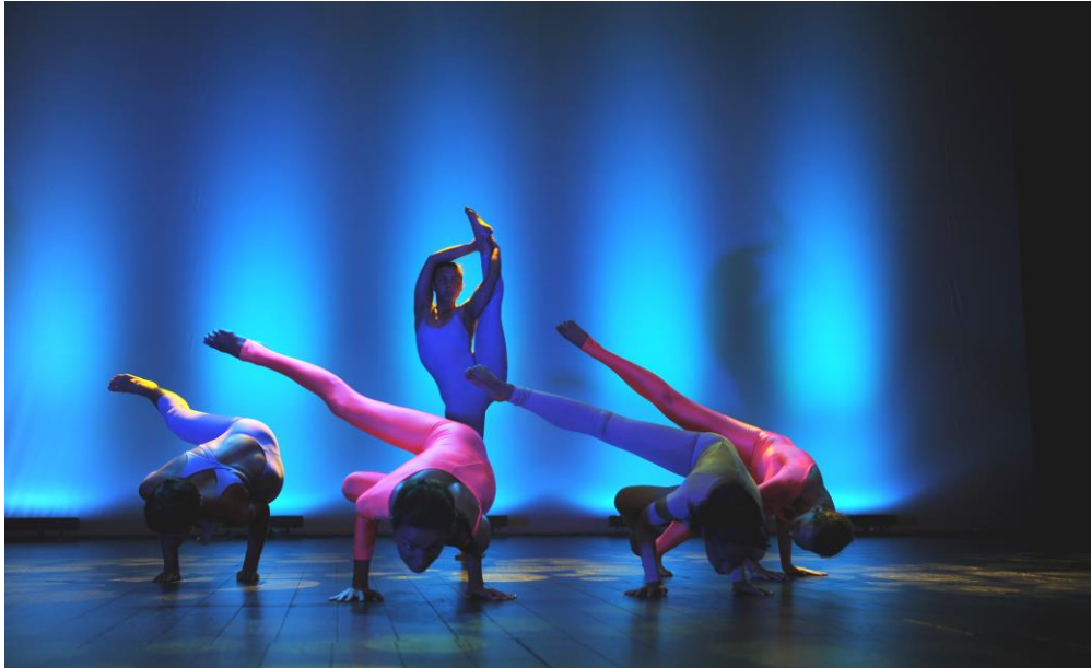
The Magic of the PASHUPATI's Presentation– OM GURU OM

The night ended with a show of beauty and harmony, performed by the Pashupati – Traditional Advanced Yoga Demonstrators Group, in a presentation focusing on the role of all the true Grand Yoga Masters of the Planet, and their importance for personal Evolution, self-demand, Tolerance and the construction of a true Human World Fraternity.