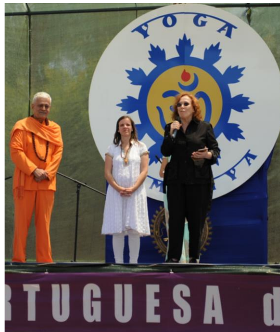
This year the Career Achievement Award was given to the actress Maria do Céu Guerra

This Day has already been officially proclaimed in India, in 2011 – December 4 th and 5 th – in a Summit that joined the Main Lineages of Traditional Yoga from India, with the co-organization of the Yoga Portuguese Confederation (the only Institution from outside India which joined this Summit). Since then the number of Countries and Yoga Institutions that have joined this movement has exponentially grown, and on this year of 2012, the International Day of Yoga - IDY was celebrated in more than 30 Cities all over the World.