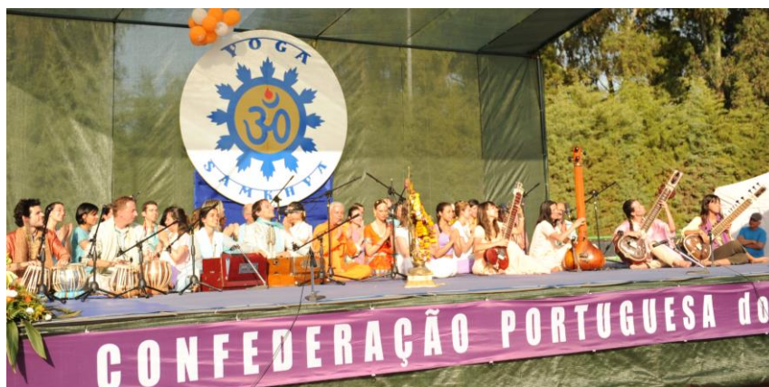
The Mantra / Kirtana from the Choir Orchestra OMKÁRA of Yoga Portuguese Confederation

At the end of the Day (with the music from Zeca Afonso) a simple Homage to Catarina Eufémia was made, who, near Beja in Baleizão, gave her life for her democratic ideals, with her immense courage to fight for the most elementary rights of Citizenship, from which we all benefit today.