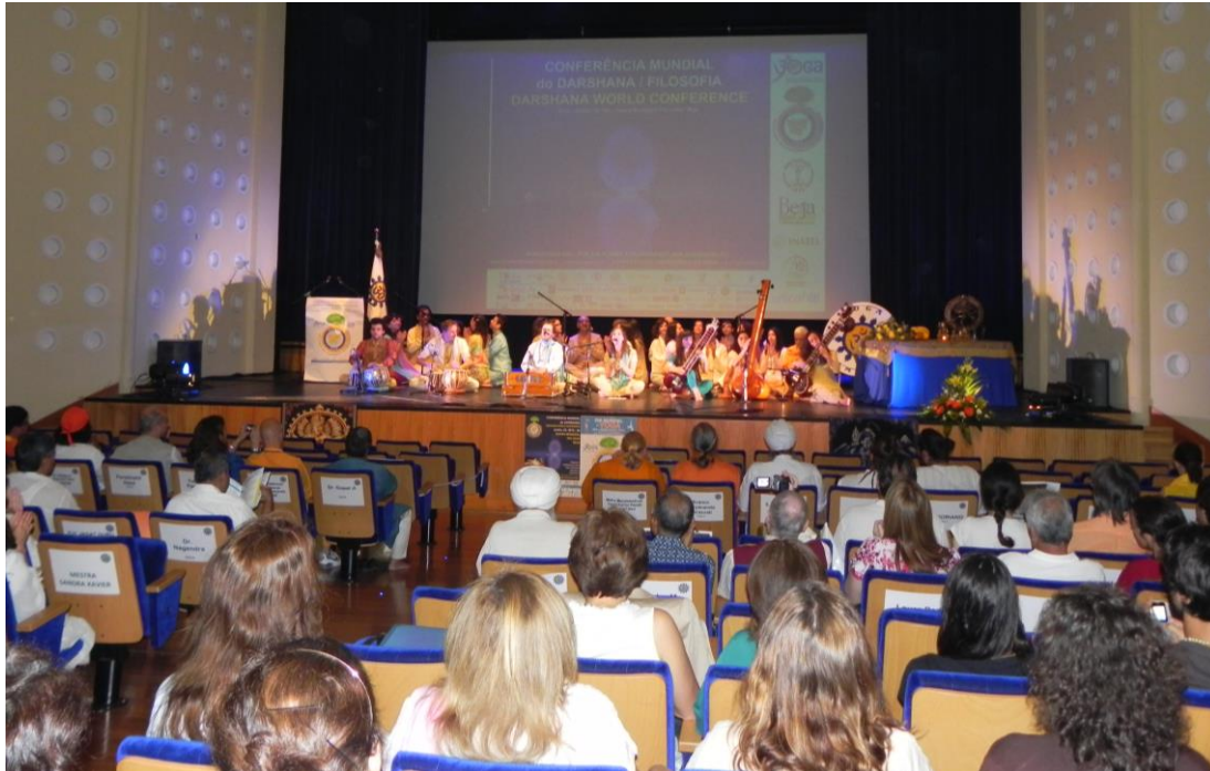
The Pax Júlia and the Omkára at the opening of the Darshana Day