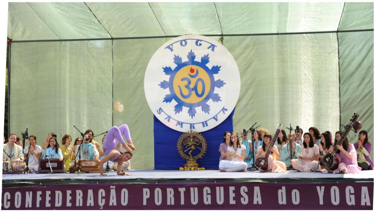
PASHUPATI and OMKÁRA on Stage