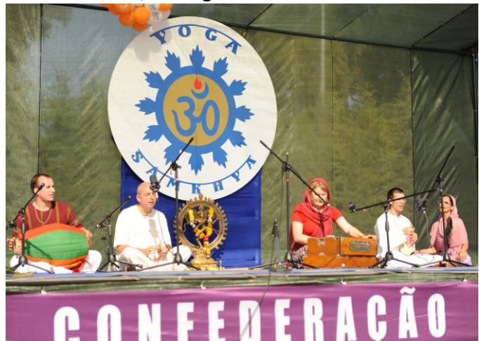
The intervention from the invited Yoga School – ISKCON Hare Krishna International Movement