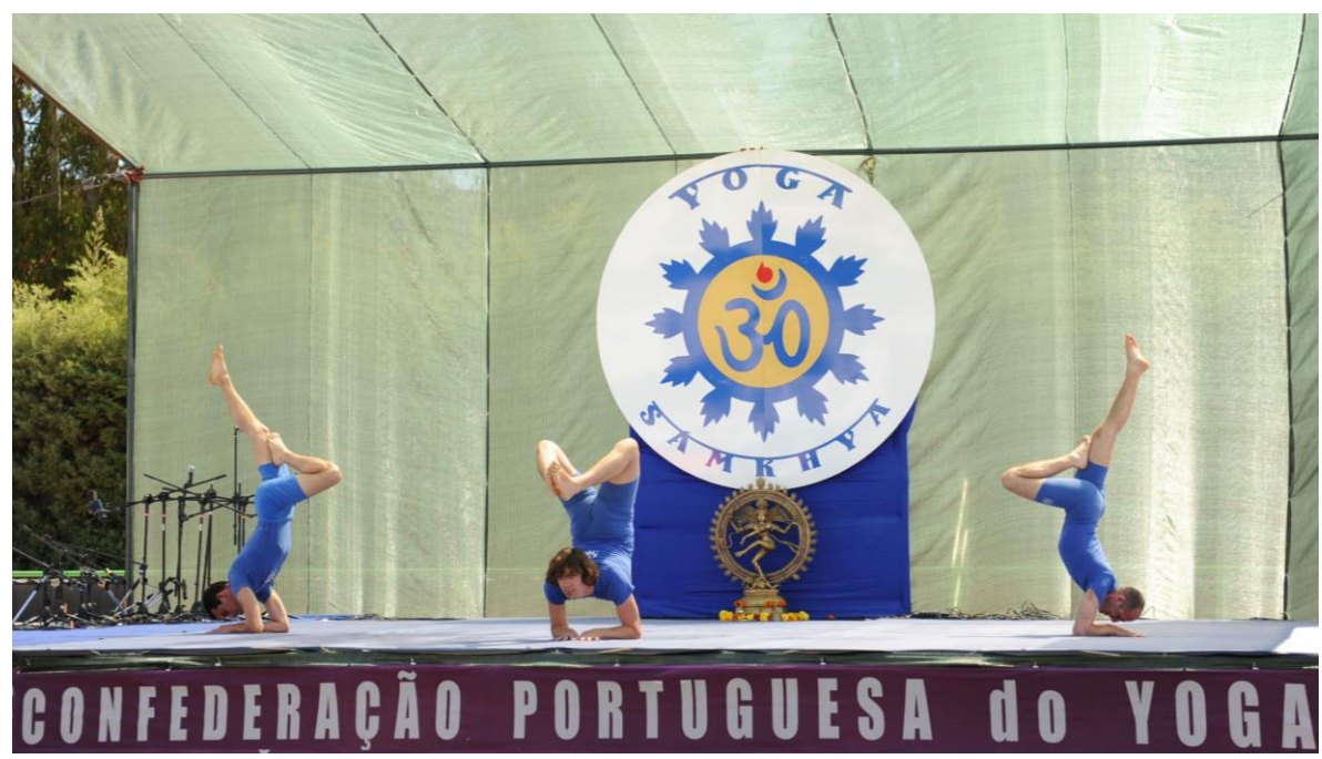
The Advanced Yoga of PASHUPATI