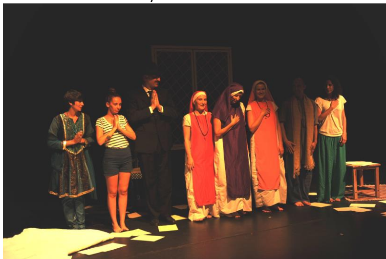
MÁYÁ – Amateur Theatre Group of the Yoga Portuguese Confederation

The night ended with a show of beauty and harmony, performed by the Pashupati – Traditional Advanced Yoga Demonstrators Group, in a presentation focusing on the role of all the true Grand Yoga Masters of the Planet, and their importance for personal Evolution, self-demand, Tolerance and the construction of a true Human World Fraternity.