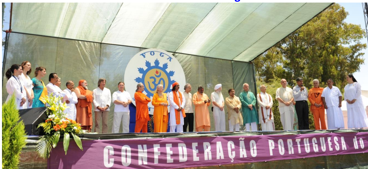
All the Yoga Schools on stage – India, Americas, Europe, with Portugal included