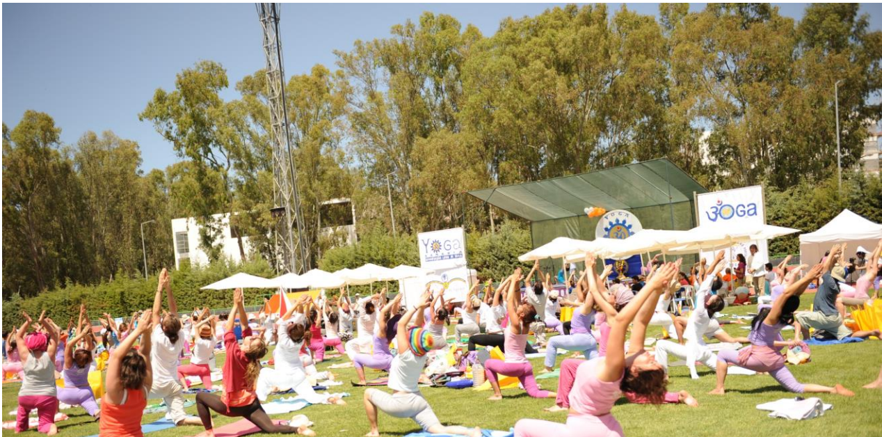
More than 1000 practitioners on the International Day of Yoga - IDY – 2012 in BEJA / PAX JULIA, The Mega Yoga Class - Purusha Namaskára

Organized by the YOGA PORTUGUESE CONFEDERATION, with the support of the CITY HALL OF BEJA, INATEL FOUNDATION and the PORTUGUESE OLYMPICAL COMMITTEE