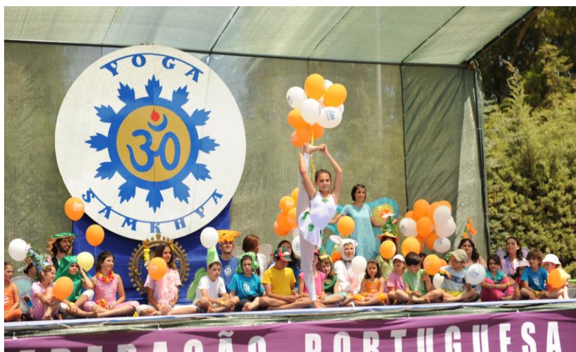
Yoga for Children – for the Defense of the Future– for self-responsibility and the preservation of the ecosystems and for Fraternity