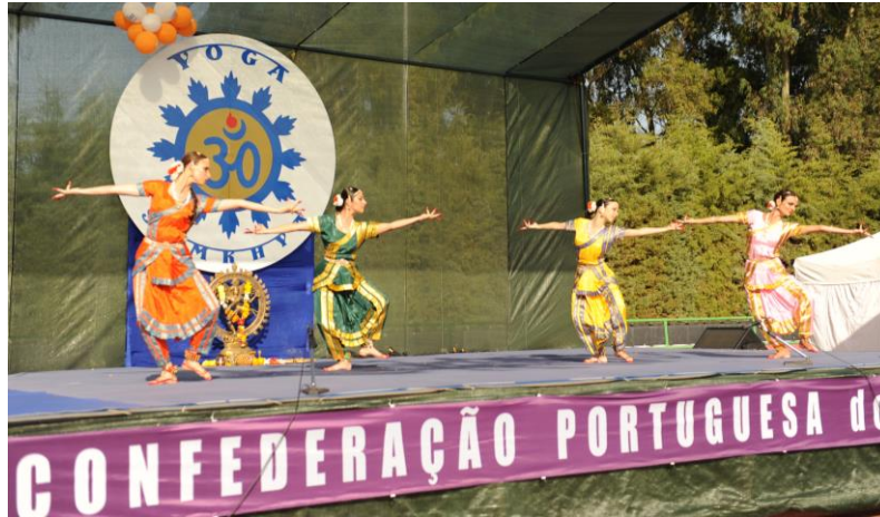
Bhārata Nāṭya Presentation by the Group Shiva Rāja