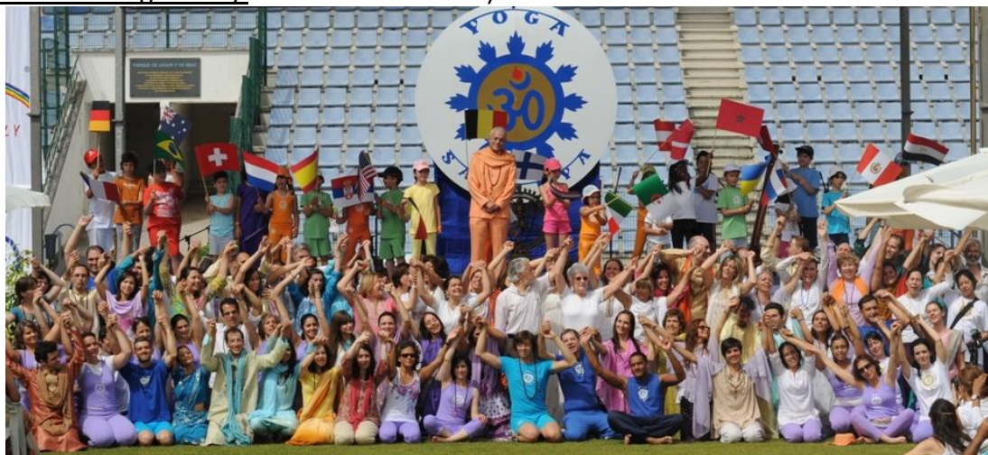
The opening of the International Day of Yoga - IDY, the Teachers of the Yoga Portuguese Confederation, The children, the World, and the Future

The International Day of Yoga - IDY is a precursor Candidate at the UN / UNESCO to become the FIRST GLOBAL DAY , it is celebrated at a Cosmic Auspice – Supra Cultural – a Solstice – June, 21 st – ( celebrated always on the following Sunday when not coincident ).