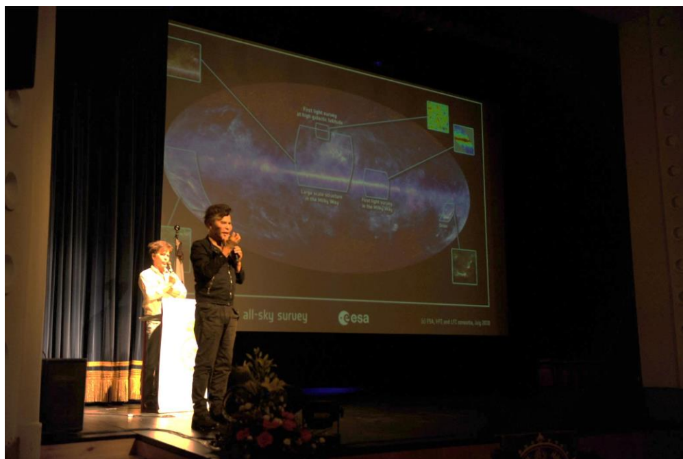
Speakers of the Sámkhya Night– Igor e Grishka Bogdanov – about the Origin of the Universe