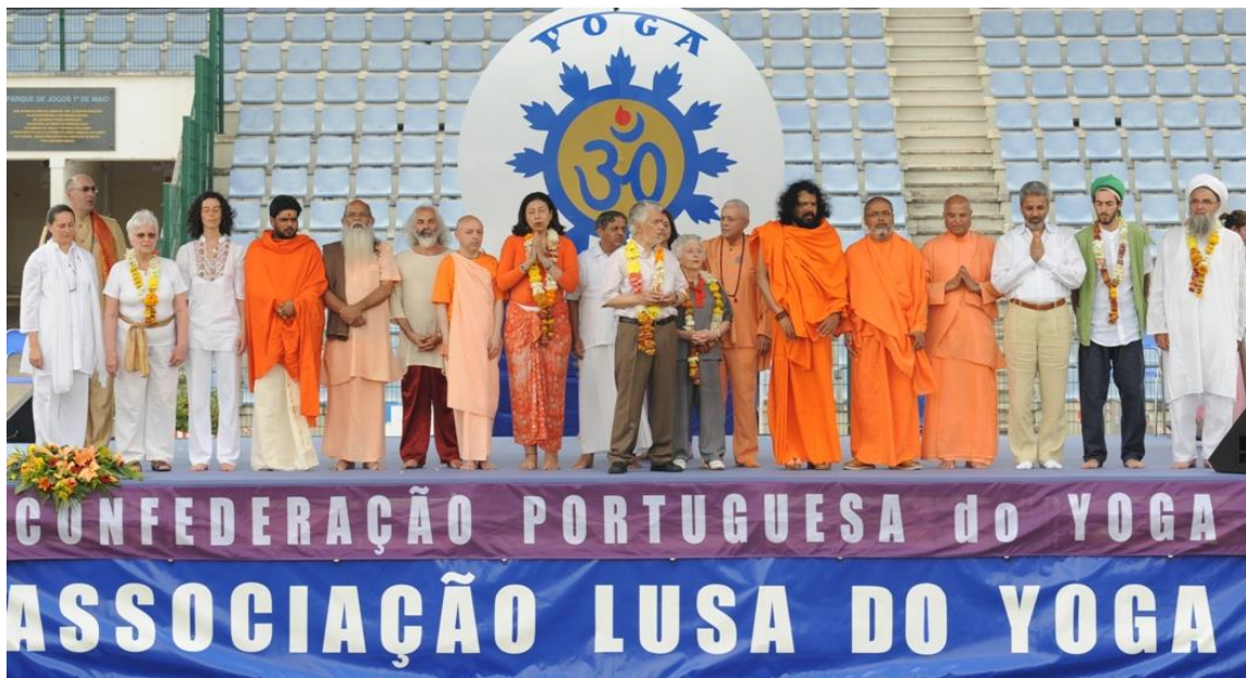
Some of the Grand World Yoga Masters at the DAYMUNDY 2011 - Lisboa