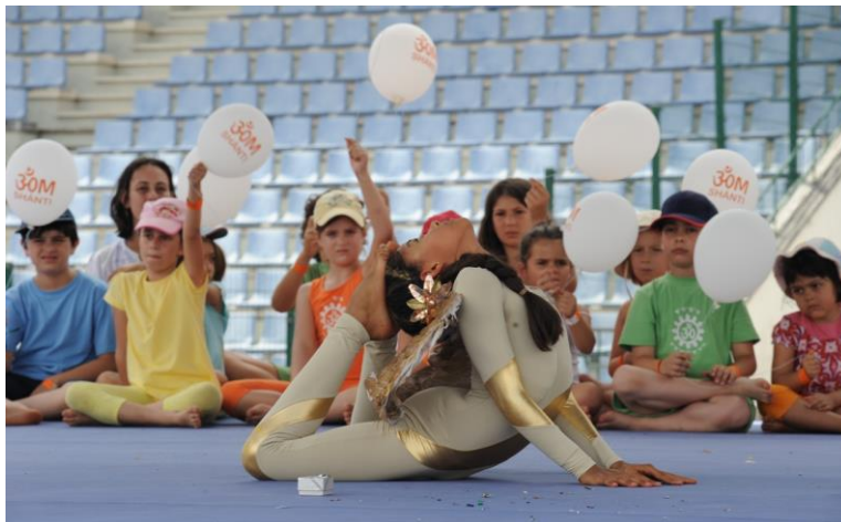
Yoga for Children – for the defense of human values and for the activation of human mental capacity