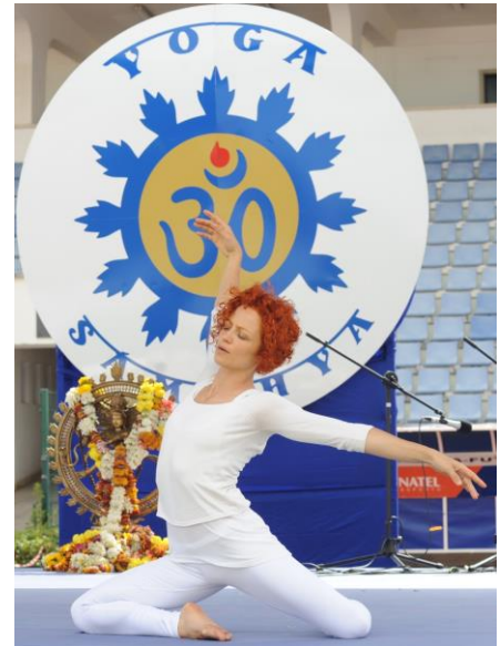
Ave Maria of Gounod by the First Ballet Dancer of the Former Ballet Gulbenkian