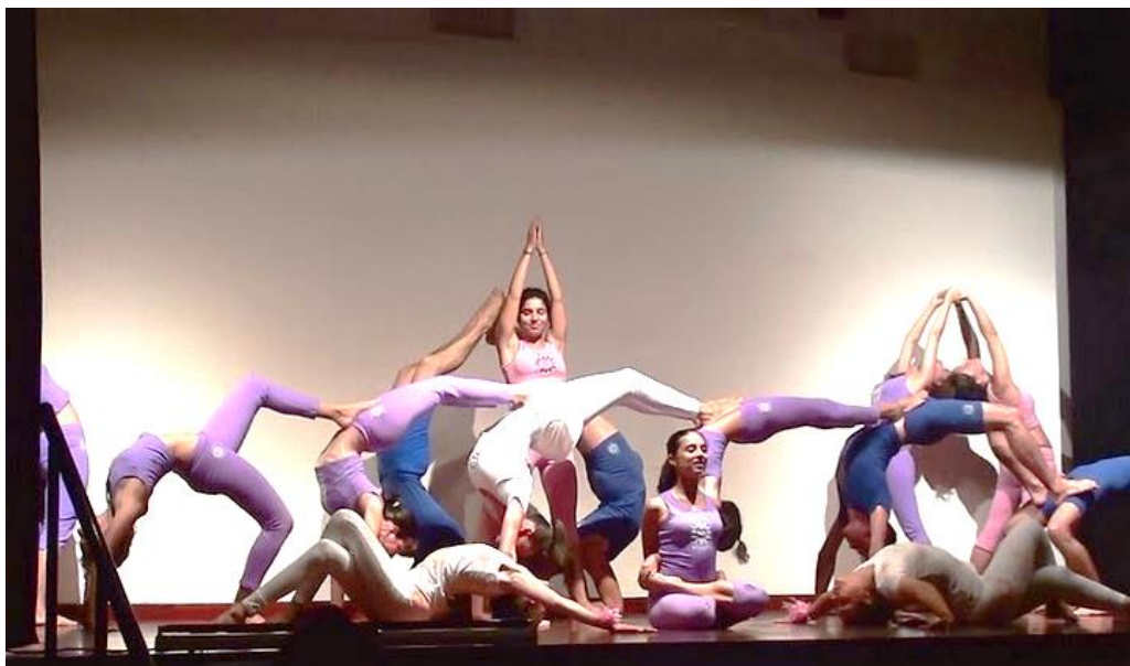
Presentation of PASHUPATI – IN THE BEGINNING