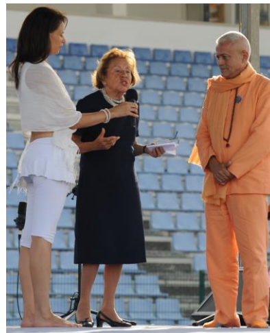
Poetry and Dr. Maria Barroso

The Architect Siza Vieira and Dr. Maria Barroso, were some of the national personalities who attended this event, also supported by other prestigious entities such as the Lisbon City Hall, the Indian Embassy in Portugal, the INATEL Foundation, the Olympic Committee of Portugal, the High Commissioner for Immigration and Intercultural Dialogue, the Oriente Foundation, the Pro Dignitate Foundation, Youth Foundation, the Portuguese Youth Institute, CP - Trains of Portugal, Lisbon Tourism and the Hindu Community of Portugal, among others.