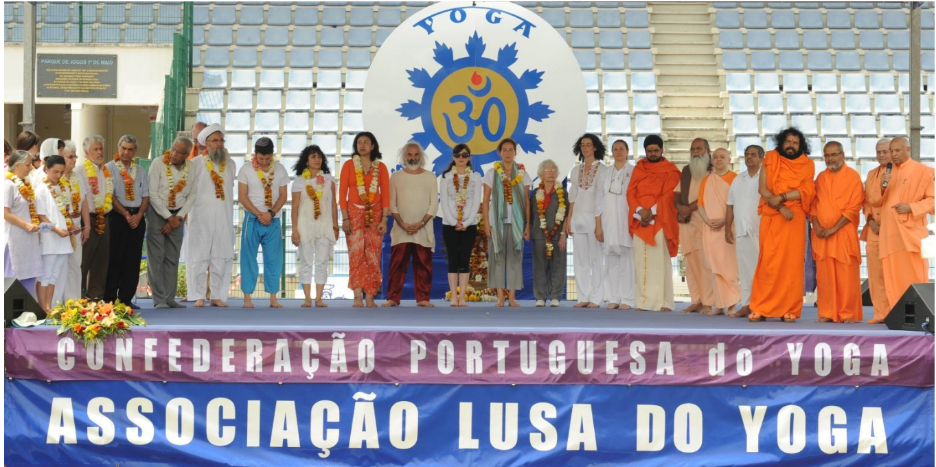
All Yoga Schools on Stage - India, Americas, Africa and Europe with Portugal included