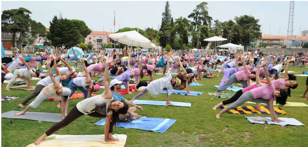
Over 1100 practitioners in the International Day of Yoga - IDY Commemorations - 2011 in Lisboa performing a Super Ásana Sequence - Purusha Namaskára

Organization by YOGA PORTUGUESE CONFEDERATION, with the support of LISBOA CITY HALL, INATEL FOUNDATION and OLYMPIC COMMITTEE OF PORTUGAL