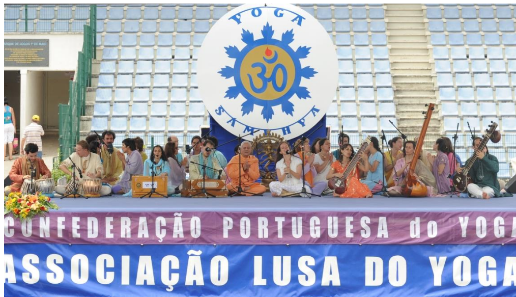
The Mantra / Kirtana of Choir and Orchestra OMKÁRA of Yoga Portuguese Confederation