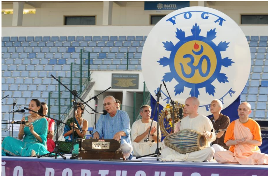
The presence of the invited Yoga School - ISKCON - Hare Krishna Movement International