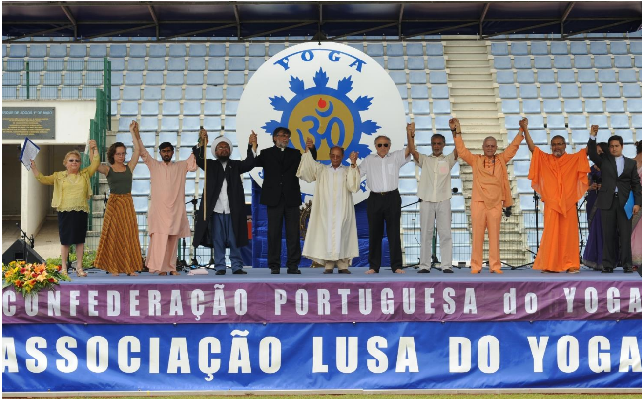
The Major World's Religions on stage - and its powerful blessing