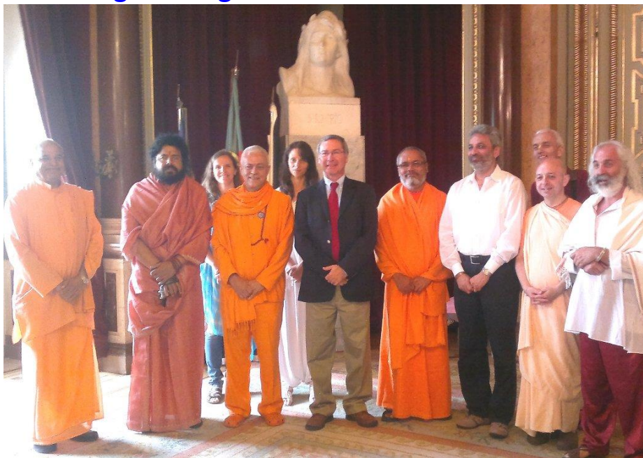
In the historic Hall of the Municipal Council of Lisboa, the capital of Portugal

On the following Monday (27 th ) the delegation of the Great Schools and Masters of Yoga was received at the Lisboa City Hall by Councilman Manuel Brito of the Sport and Education Areas where it was noted that the Grand Master of Yoga H.H. Jagat Guru Amrta Súryánanda Ji Mahá Rája is an Ambassador of Portugal and of Intercontinental Peace around the planet.