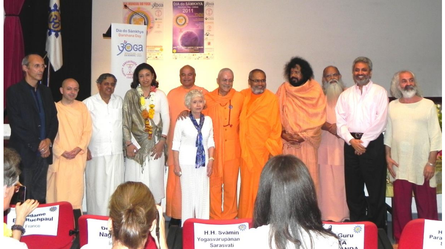
Speakers of the Sámkhya and Darshana Day