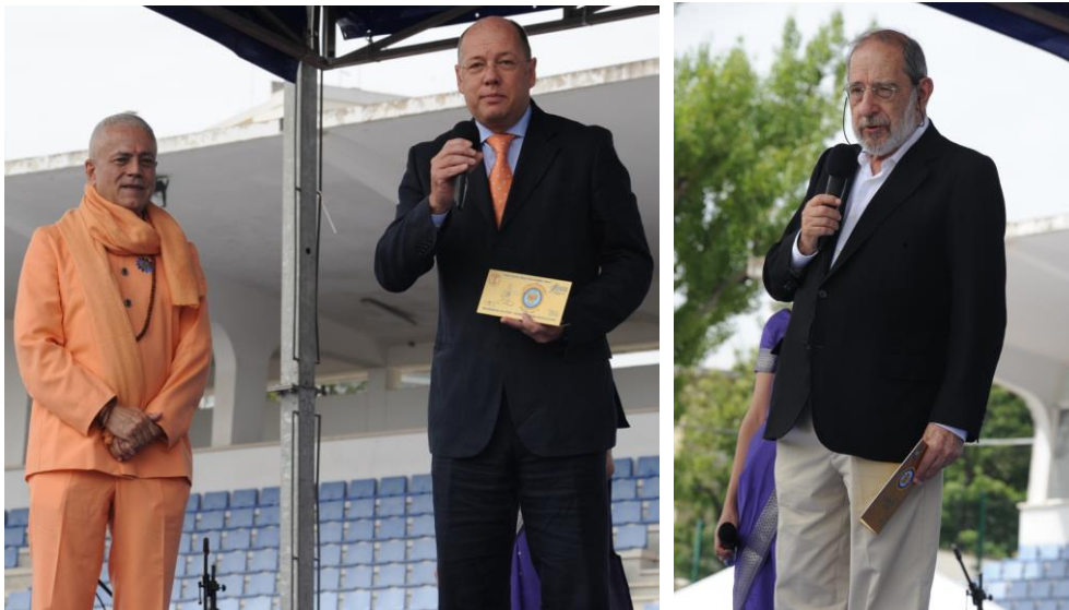
The delivery of Gandhi / Sérgio Vieira de Mello Award to QUINO and Arch. Siza Vieira