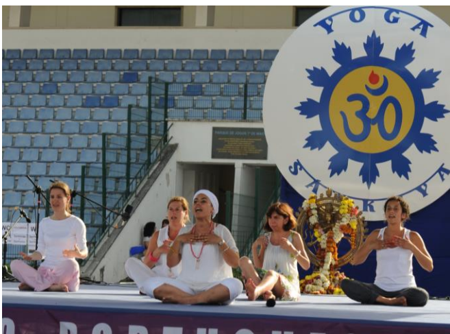
Practice of the invited Yoga Schools - the Kundalini Yoga