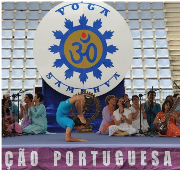
PASHUPATI and OMKÁRA on stage