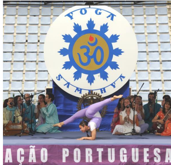
The Advanced Yoga of PASHUPATI

Candidate at UNESCO to become the First Worldwide Holiday (celebrated on the Sunday immediately after if not coincident) – at the Solstice, June 21 st - a Day of World Fraternity, Inter Ethnic, Inter Cultural and Inter Religious, and for 24hours without bloodshed in the World, counted with the participation and support of the main Yoga Masters in India, USA, Canada, North Africa, Egypt and Europe - France, Spain, Italy, England, Holland, Belgium, Greece, Switzerland, Germany, and Portugal, as well as representatives of the major World Religions , among other figures.