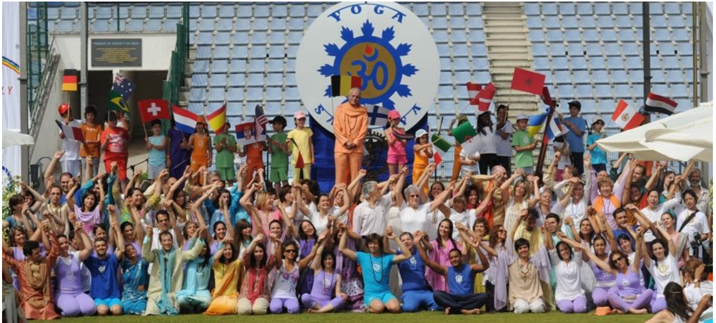
The Opening of DAYMUNDY, the Teachers of Yoga Portuguese Confederation, and of Portugal Children, the World and the Future

The International Day of Yoga - IDY is a precursor candidate to the United Nations and UNESCO to a First Worldwide Holiday celebrated in a Cosmic Auspice - Supra Cultural - a Solstice - June 21 st - (always celebrated on the following Sunday when not coincident).