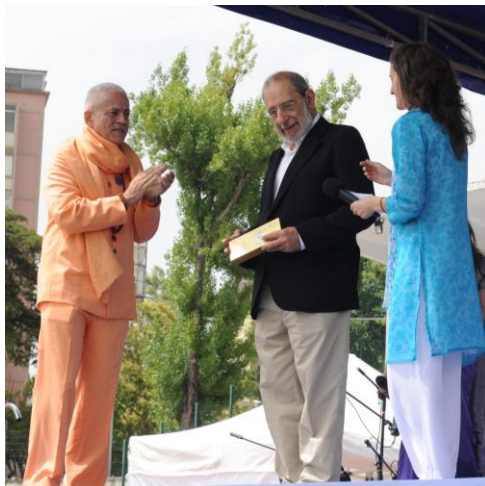
Homage to the Architect Siza Vieira

Candidate at UNESCO to become the First Worldwide Holiday (celebrated on the Sunday immediately after if not coincident) – at the Solstice, June 21 st - a Day of World Fraternity, Inter Ethnic, Inter Cultural and Inter Religious, and for 24hours without bloodshed in the World, counted with the participation and support of the main Yoga Masters in India, USA, Canada, North Africa, Egypt and Europe - France, Spain, Italy, England, Holland, Belgium, Greece, Switzerland, Germany, and Portugal, as well as representatives of the major World Religions , among other figures.